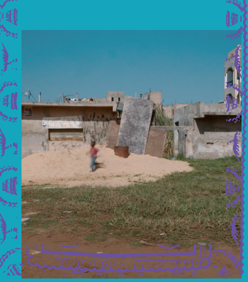
Senegal - Keur Massar

Centre Yennenga / 2022 / Senegal / 5m In Keur Massar, Senegal, following annual flooding, residents and community organizers show the effects on their lives and homes of poor infrastructure and the increasing impact of climate change. This short film shows how the residents live with and through the flooding, and explores the causes of and possible solutions to this crisis.