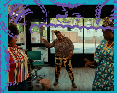
Precious Hair & Beauty

SUN, MAY 15 AT 2:00PM Co-Presented with Be Reel Black Cinema Club