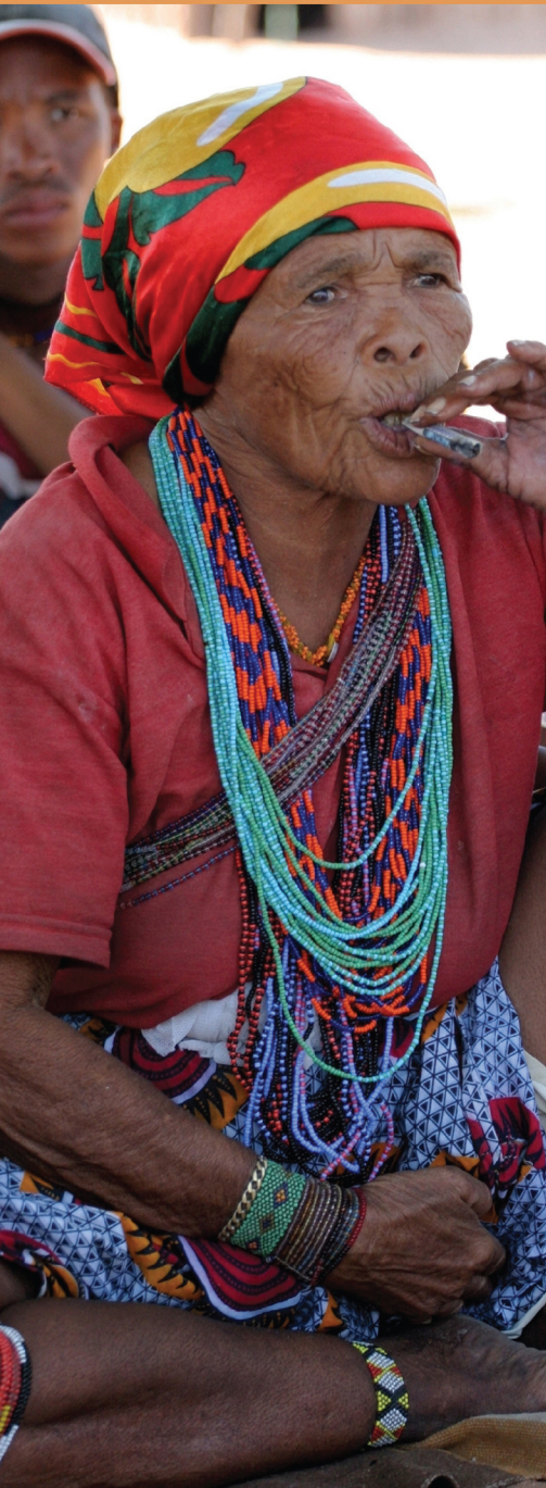
BUSHMAN'S SECRET Rehad Desai | South Africa | 2006